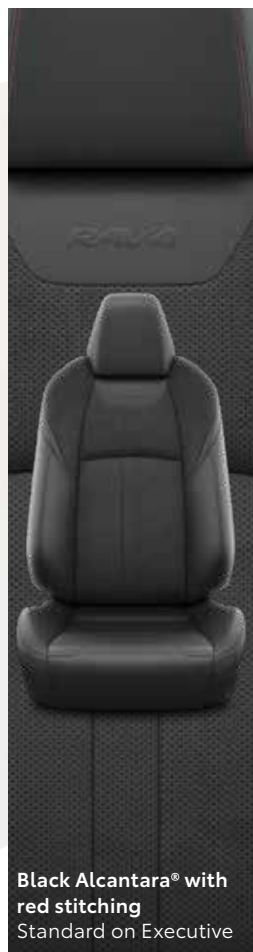
Black Alcantara® with red stitching Standard on Executive