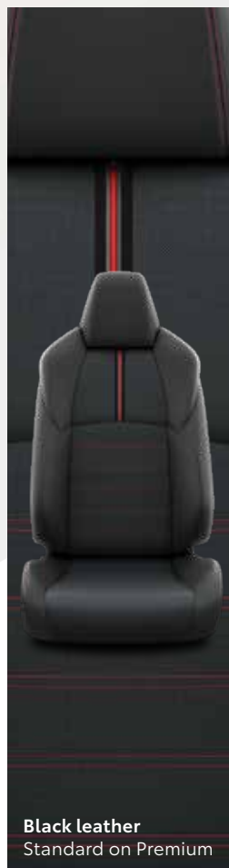
Black leather Standard on Premium