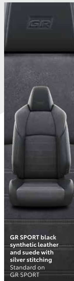
GR SPORT black synthetic leather and suede with silver stitching Standard on GR SPORT